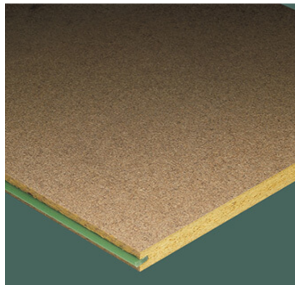
Figure 1 Termite Treated Particleboard Flooring